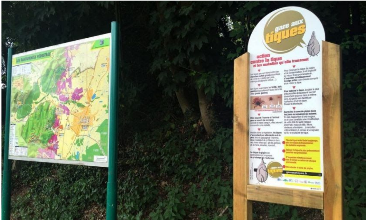
One of the new French signs warning of ticks at forest trailheads. France, 2017.

At the entrance to forests in eastern France — in Kintzheim in Alsace, or La Haye in Lorraine — you’ll find more "beware of ticks" signs, with tips on what to look for and how to remove them.