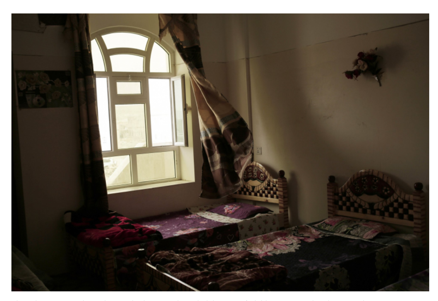
This July 28, 2018, photo shows a bedroom at the Rehabilitation Of Children Recruited and Impacted By War in Yemen Project center in Marib, Yemen. The Houthis have inducted 18,000 child soldiers into their rebel army since the beginning of the war in 2014, a senior Houthi military official acknowledged to The Associated Press. Yemen, 2018.

They are told they are joining a holy war against Jews and Christians and Arab countries that have succumbed to Western influence — and that if the boys die fighting, they will go to heaven. The instructors fuel the recruits' anger with accounts of coalition attacks that have killed civilians, including an airstrike in August that hit a bus full of schoolchildren.