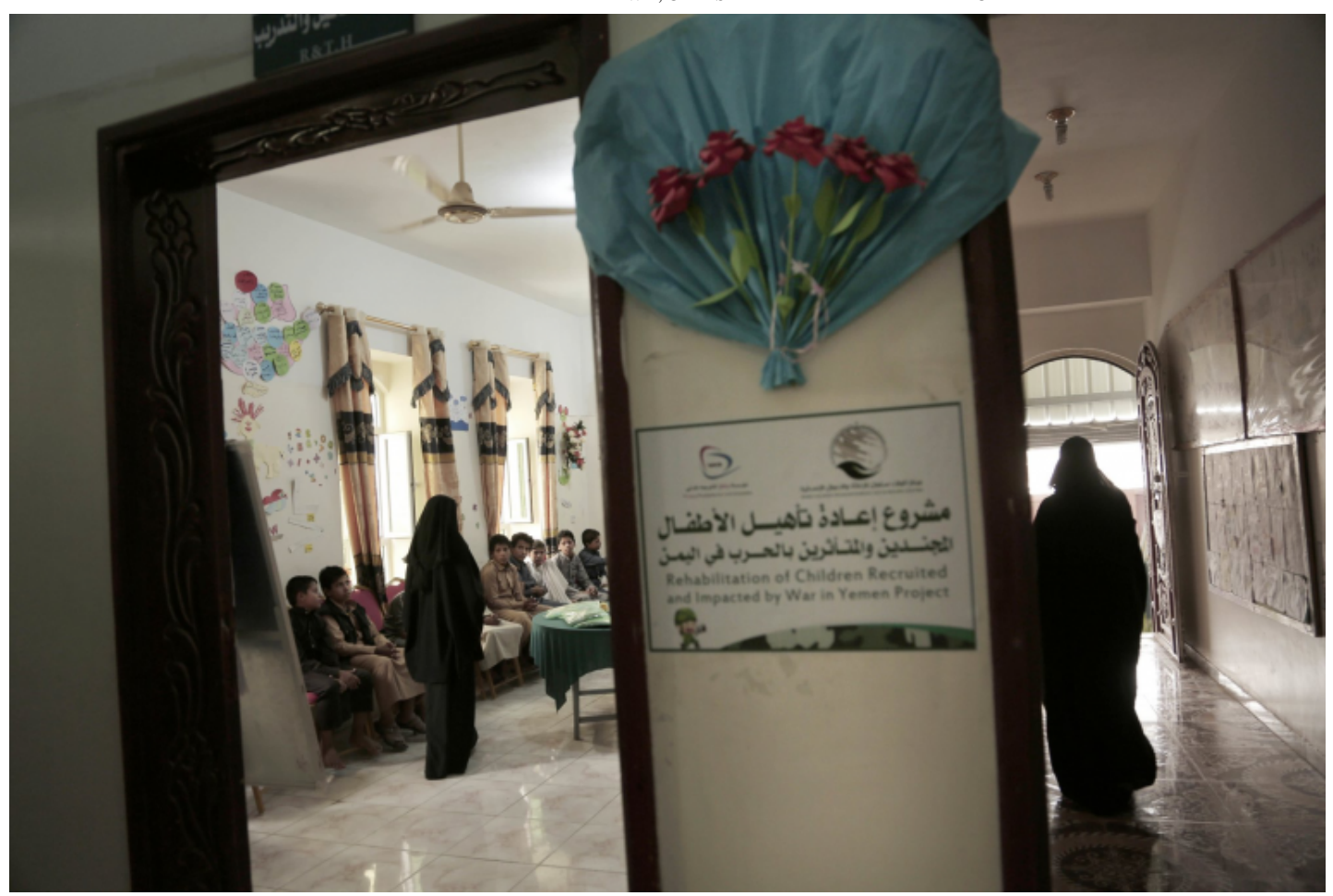
Boys listen during an Arabic language class at a rehabilitation center for former child soldiers in Marib, Yemen, in this July 28, 2018, photo. Nearly 200 former child soldiers have come through the Saudi-funded center, where they try to learn how to deal with the traumas and horrors they saw in combat. Many suffer from aggressive behavior and panic attacks. Yemen, 2018.

In villages and small towns, recruiters include teenagers whose brothers or fathers already work for the Houthis. They can be seen hanging around schools, handing out chewing tobacco and trying to persuade the boys to become fighters.