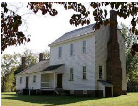
Historic Stagville Plantation, Durham, NC