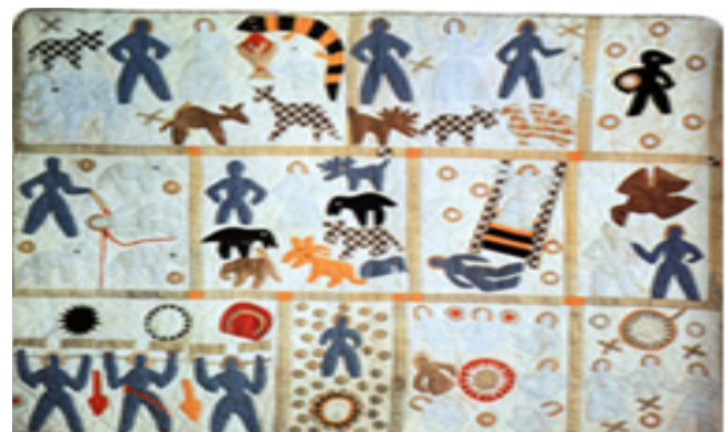
"Quilt" by Harriet Powers 1886