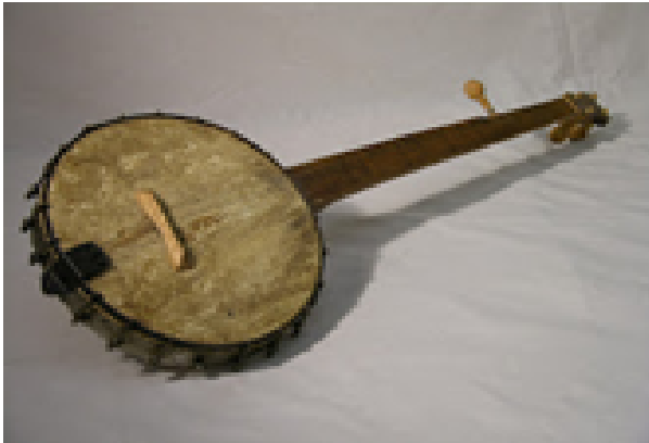
African American Banjo