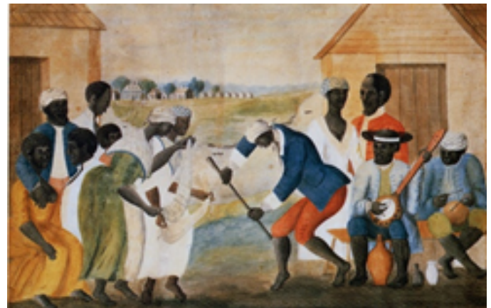
Plantation Dance, South Carolina, ca. 1785-1795

On board slave ships during the Middle Passage, enslaved Africans were frequently forced to dance. Once a day, some of them were brought up from the hold and encouraged to drum, sing, and dance. Slave captains believed that dancing enlivened the captives' spirits and reduced their sense of pain, suffering, and longing. Unbeknownst to the slave-ship captains, the daily dancing and exercise regime likely provided one of the bases for the continuity of African-based expressive culture in the New World. For the rhythms and dances preserved during the Middle Passage became the roots of New World African music and dances. Singing, drumming, and dancing resurfaced in new, transformed rhythms and music in slave communities and societies.