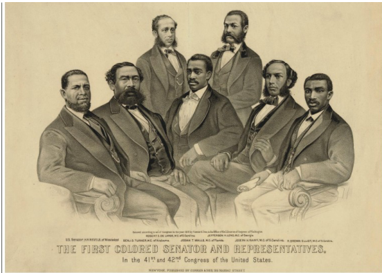
An 1872 portrait of African-Americans serving in Congress (from left): Hiram Revels, the first black man elected to the Senate; Benjamin S. Turner; Robert C. De Large; Josiah T. Walls; Jefferson H. Long; Joseph H. Rainey; and R. Brown Elliot.

https://www.loc.gov/pictures/item/98501907/