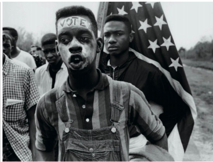
A demonstrator at the 1965 march from Selma to Montgomery, led by the Rev. Dr. Martin Luther King Jr. to fight for black suffrage.

https://www.history.com/news/the-silent-protest-that-kick-started-the-civil-rights-movement