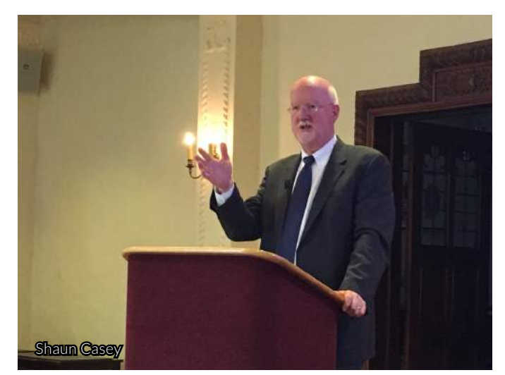
those of us who work in government in Washington D.C. at the end of a trail and they started this work locally, they've moved to the state level, they then graduated to the regional level and now they are in the international scene and they have found to come and interact with the U.S. federal government.

What I'm most interested in, though, are the new players. The people, frankly, who have found their voice and found their organization primarily since 9/11—I would say certainly in the last 15 years. Their numbers are growing and they're finding