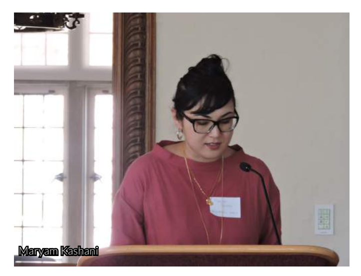
serve and mobilize their communities while also speaking to a larger American public.