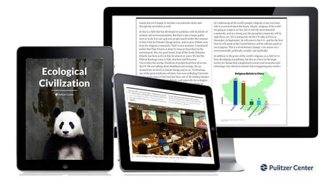
Ecological Civilization , Pulitzer Center e-book on proceedings of conference at Yale Beijing Center, June 2015. Download: bit.ly/EbookBlog

I think all of us from the outside, the non-Chinese, were really taken aback by how frank the Chinese were when talking about the extent of the problems that they faced and the pressures they were under and how they were trying to engage in this issue even under the constraints of government that was really in the midst of imposing a lot of restrictions on media activity. The environment is an interesting exception to that trend. We can talk more about this in the Q&A. Why is it an exception? Because there is so much public unrest about the kinds of images that Jiangiang just showed us. About the smog in Beijing and the food you can't trust, the milk you can't drink. There is actually something on the order of 55,000 protests every year is China, public protests over environmental issues. The government knows this. The government knows that they have got to address these issues if they are going to stay in power or if the Communist Party is going to stay in power.