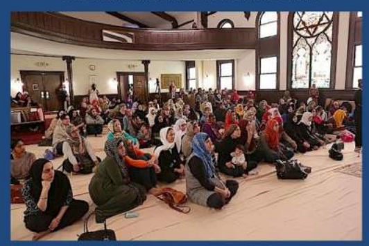
"The Other Muslim Fringe" in the U.S. and Europe